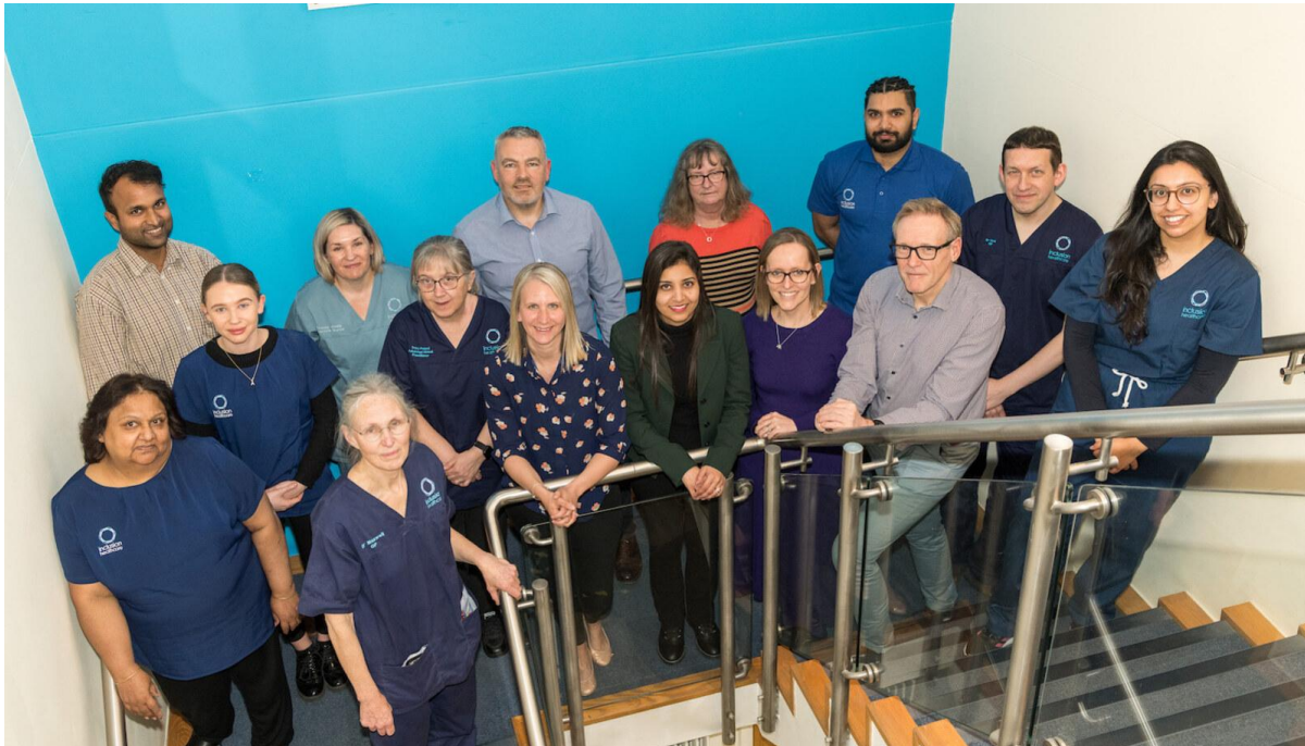
Our team at Charles Berry House, Leicester

with Clinical Experience · Inclusion Healthcare Social Enterprise CIC, Leicester