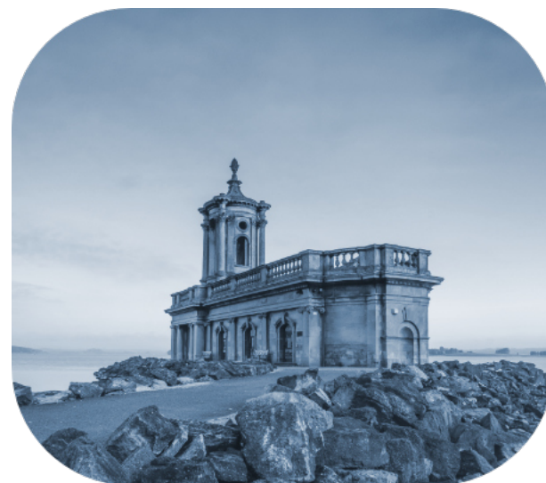
East Leicestershire and Rutland region

I continue to be an advocate to enable PCNs to flourish in LLR and making sure that all the funding related to PCNs like the ARRS monies are passed to PCNs. I hope to continue to make sure that all practices in LLR are treated fairly and equitably and would like to thank you all for your ongoing support that enables me to serve our practices to the best of my abilities.