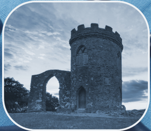
West Leicestershire region