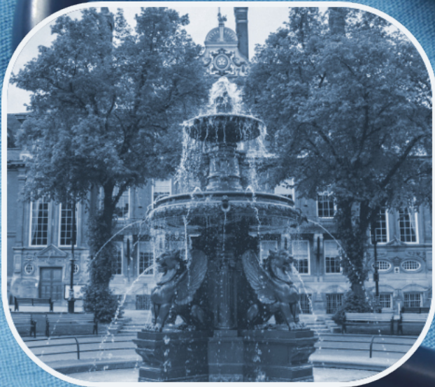
Leicester City region